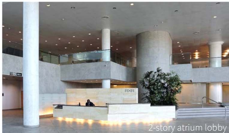
2-story atrium lobby