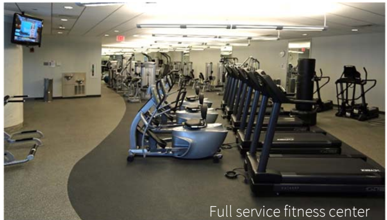
Full service fitness center