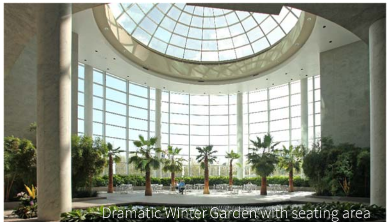
Dramatic Winter Garden with seating area